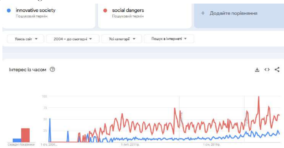
Fig.3. Dynamics of queries on the topics of “social dangers” and “innovative society” in the world in English since 2004

Regarding further analysis, the author set the task of determining the level of interest for comparison specifically with the topic of “social dangers” (“social dangers”) in the world, which was carried out in English for the period since 2004, as well as the topic of “innovative society”. The search results are given in Fig. 3.