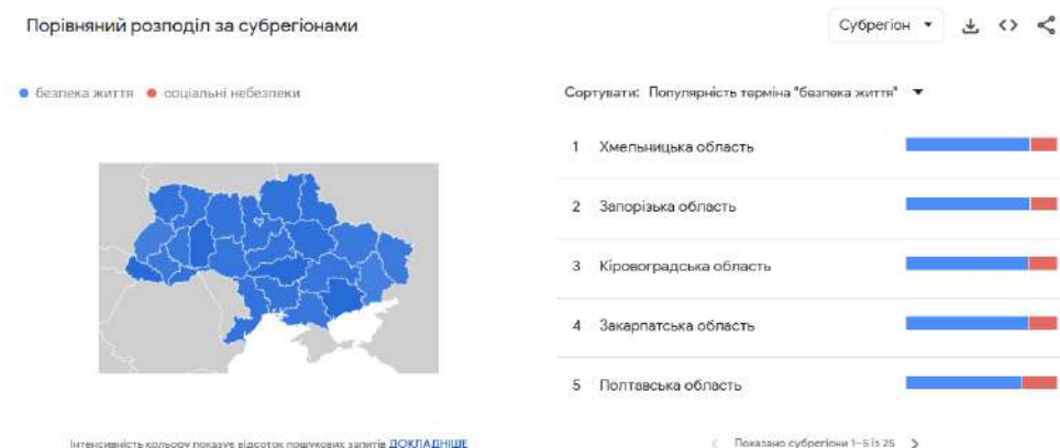
Fig. 2. Regional distribution of topics of life safety (blue field) and «social dangers» (red field) on the date of the query (June 1, 2025) in dynamics since 2004

Fig. 2 shows the regional distribution of interest in the topics of life safety and social dangers in Ukraine, provided by Google Trends.