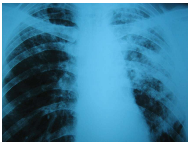
Figure 2: X-ray of the chest after 2 months of treatment.

Upon admission to the Institute, the general condition of the patient was satisfactory. Complaints of coughing with sputum, weakness, sweating.