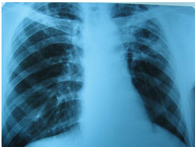
Figure 3: X-ray of the chest after 8 months of treatment: in the background metastatic tuberculosis pneumofibrosis, mainly in the upper sections focal-infiltrative changes that continue to dissolve and thicken, cavitations decreased in size, the walls became thinner.

patient's blood. As a result, malabsorption leads to the formation of a large number of "mutant" strains, an increase in drug resistance and disease progression [8-10].