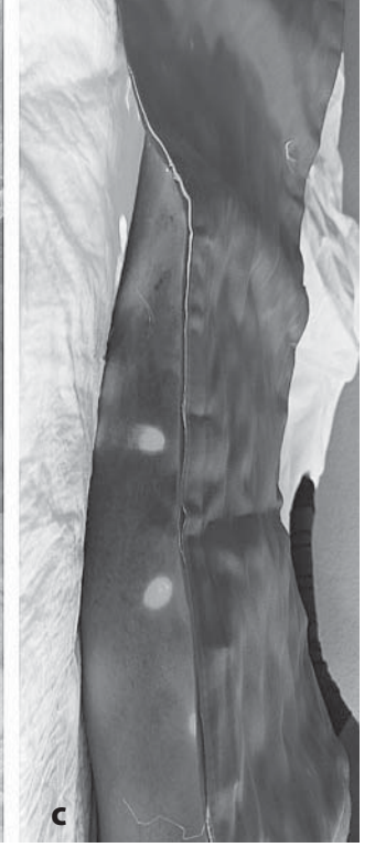
Fig. 1. Patient A., 56 years old. PTS, microbial eczema of the right shin: a) before treatment; b) photosensitizer applied; c) irradiation with A. M. Korobov's photon matrix.