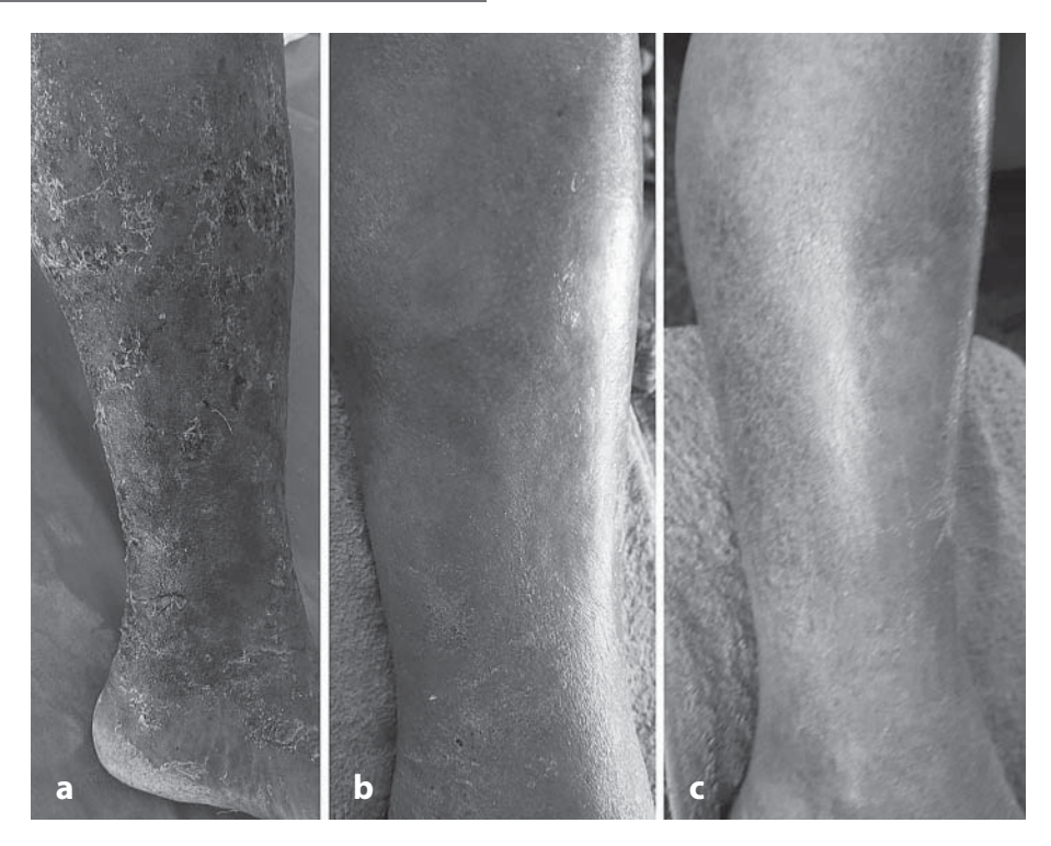
Fig. 3. Patient A., 56 years old. PTFB: a) 14th day of treatment; b) 21st day of treatment; c) 35th day of treatment.

and according to ultrasound examination of the subcutaneous tissue (Fig. 3, 4).