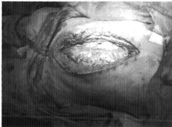
Figure 1. Placing the first multiperforated polyethylene sheet.