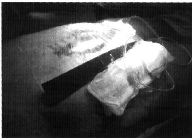
Figure 2. Second polyethylene sheet placed with the system under negative pressure.