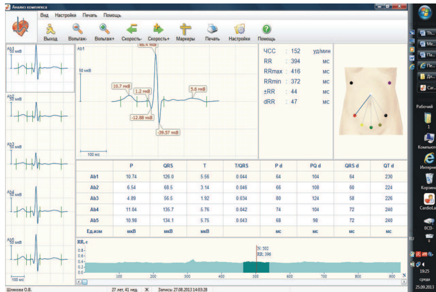
Fig. 1. The “window” in the “Cardiolab Babycard” program. The sample of fetal ECG parameters evaluation

spectral compounds: VLF, LF and HF. The temporal characteristics of the fetal HRV: SDNN, RMSSD, pNN50, AMo and SI were determined. The CTG waveform analysis was performed with STV (short term variability) and LTV (long term variability) scoring. The fetal ECG parameters such as: pQ, QT intervals and QRS complex duration, T wave amplitude, T/QRS ratio were calculated (fig. 1).