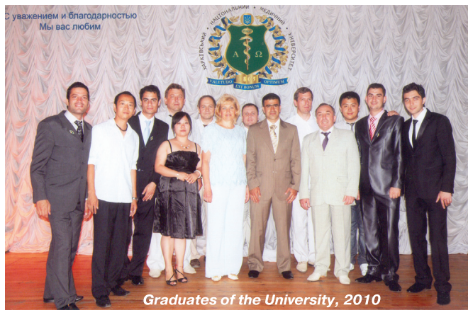
Graduates of the University, 2010