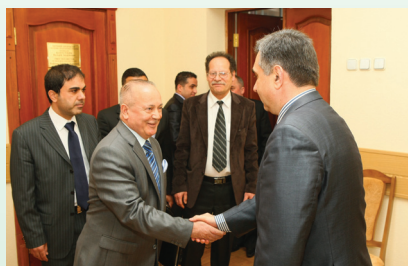
A meeting with the Ambassador of Iraq