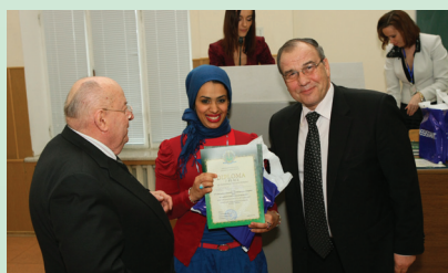
The best report of the year

of participants grew and during the 4th International Interdisciplinary Scientific Conference for Medical Students and Young Scientists (ISIC) in 2011 the numbers of participants and participating countries increased significantly and reached 262 people, including 84 foreigners. This year's conference was attended by young scientists from different countries: Ukraine, Russia, Belarus, Poland, Portugal, Germany, Bulgaria, Serbia, Montenegro, Bahrain, Nigeria, Egypt, and others.