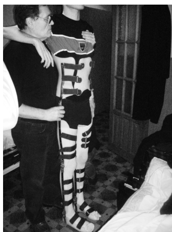
Patient C. Diagnosis: Sequelae of the C5-C6 fracture. Beginning of kinesotherapy in orthoses.

At present, spinal injuries occur in 29.4-50 cases per 1 million of people,