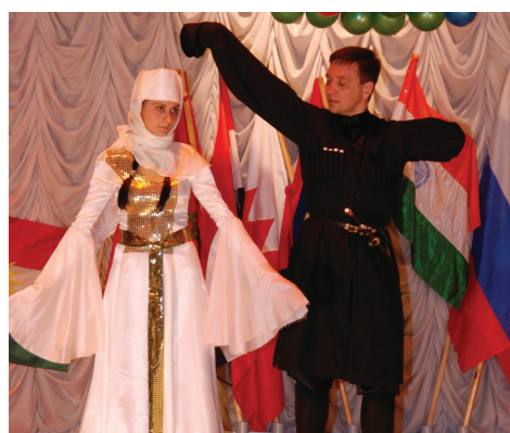
A Georgian dance