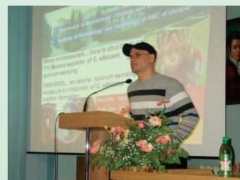
A report of a participant in the Conference

The first attempt of a youth congress of medical and biomedical sciences, that level for the life of independent Ukraine, was proposed at the International and Interdisciplinary Scientific Conference (ISIC) in 2008 with participation of more than 120 young scientists and students from different parts of Ukraine, Russia, Belarus, Poland, Serbia and Montenegro. Every year the number