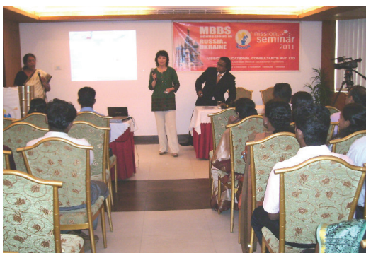
A workshop in Trivandrum

Twenty-three workshops were held, at which achievements of KhNMU in training highly qualified specialists for foreign countries were presented, opportunities and advantages of studying in the English language were explained, and communication with future students and their parents was carried out. The most meticulous attention was paid to questions concerning the University's level of accreditation, recognition of its degree by the Medical Council of India, different manifes-