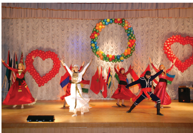
A Georgian dance group