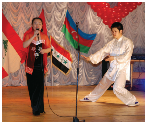
A Chinese song

International musical students' festivals are some of the most important parts of our social life.