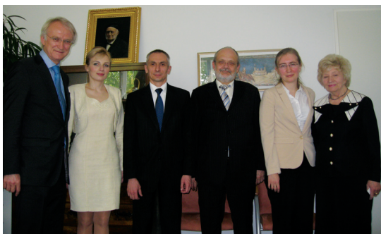
With participants in the Conference