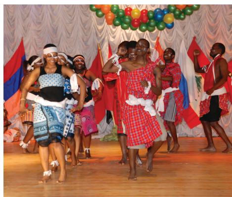
A Kenyan dance