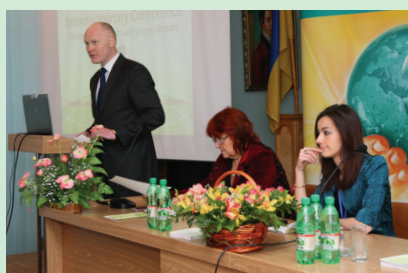
The grand opening of the Conference

On April 13-14, 2011 Kharkiv National Medical University held the 4th International Interdisciplinary Scientific Conference for Medical Students and Young Scientists (ISIC), which entered the Register of the congresses, symposia and scientific conferences of the Ministry of Health of Ukraine.