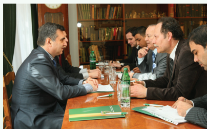
During the meeting

During the meeting, the parties discussed the ways for improving the academic process quality for students, paid attention to increasing the students' level of proficiency in the English language, examined aspects