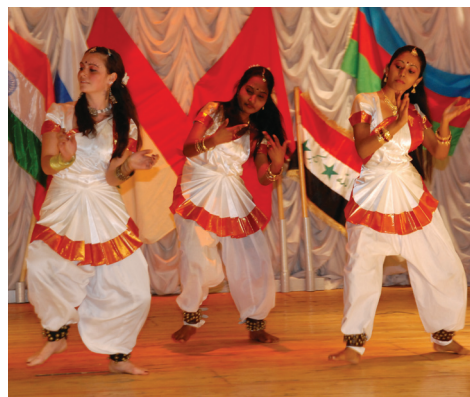
An Indian dance