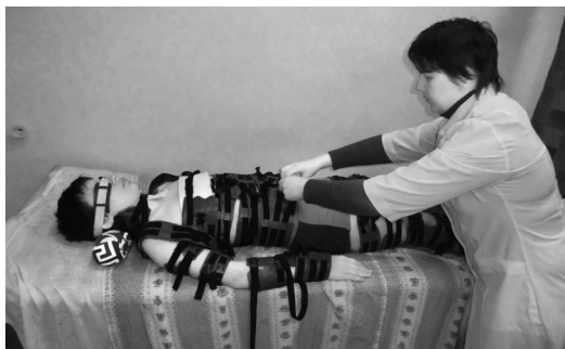
Reflexotherapy with a Lyapko applicator

orehabilitation of the “learned non-use” phenomenon. The success of this technique is predetermined by both introduction of specific autocellular substances, induction of cascade responses of early verticalization of a patient with TSCI and use of Lyapko applicators. The latter involve all hierarchic levels of the organism, thereby corresponding to a concept of the modern biorehabilita-