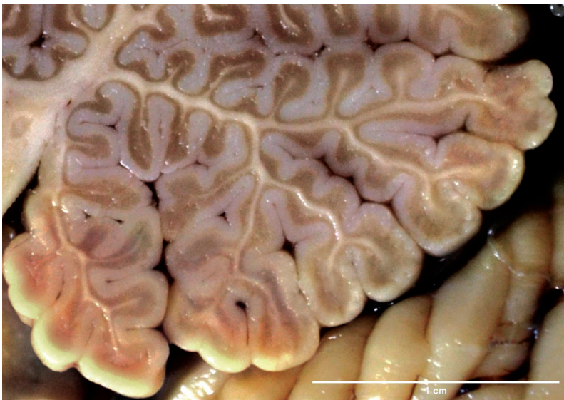
Fig.1. Midsagittal section of human cerebellum vermis, folia of lobules IX and X. Scale bar 1 cm.