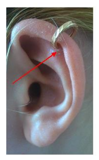
Figure 2 - Perichondritis of the auricle

The smallest number of inflammatory complications occurred with the use of titanium products, however, this type of jewelry was less commonly used, which does not allow to consider the differences as statistically significant (p > 0.05)