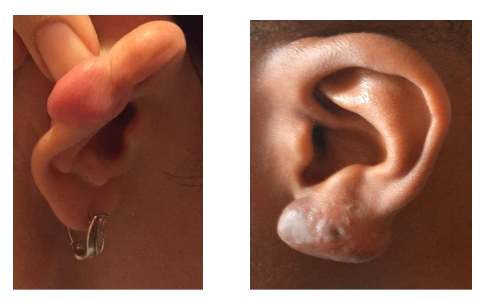
Figure 2 - Complications - keloid scar on the ear after wearing gold earring

Among the complications found in patients wearing gold articles, 32.0% had keloid scars. Patients complained of pain, itching in the area of the scar, skin tightening and paresthesia in the piercing area. Objectively, a tight, round or oblong shape was defined in the piercing area. With small keloids (0.1-0.4 cm), the skin above them is shiny sometimes hilly, with large sizes it has a color from pale pink to purple-cyanotic. Keloid, in its shape, resembled a tumor and had invasive growth beyond the initial lesion, while strongly standing out on its surface (Fig. 2).