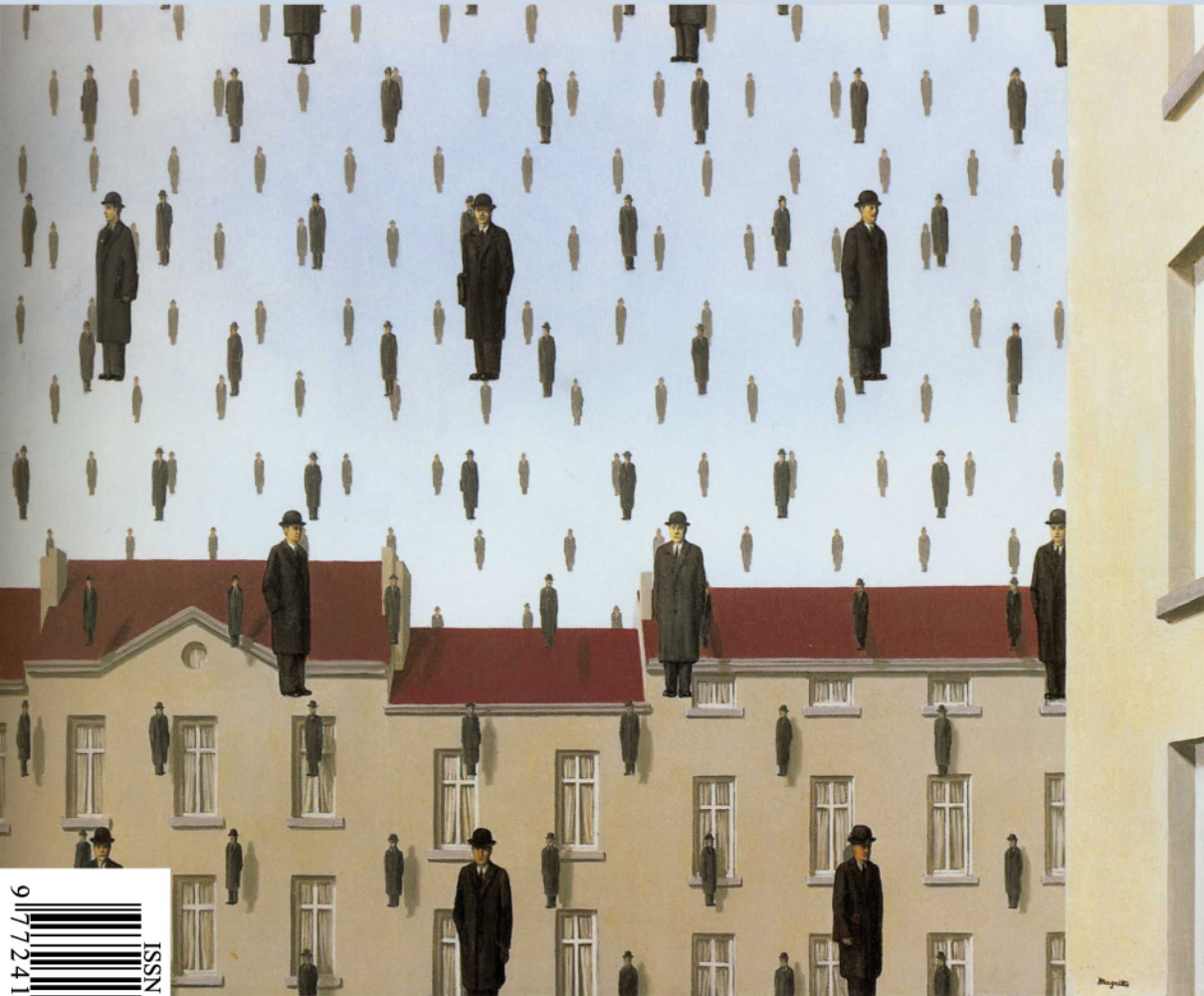
«Голконда», Рене Маргітт, 1953